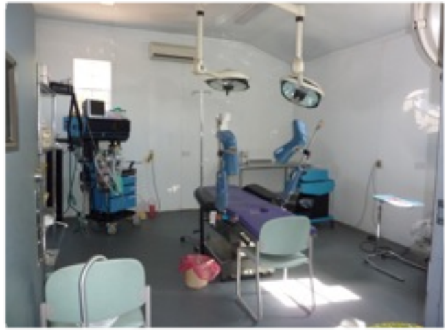
Newly outfitted two-room operating suite